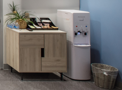
Labryo Medical Office Building Newport Beach, CA